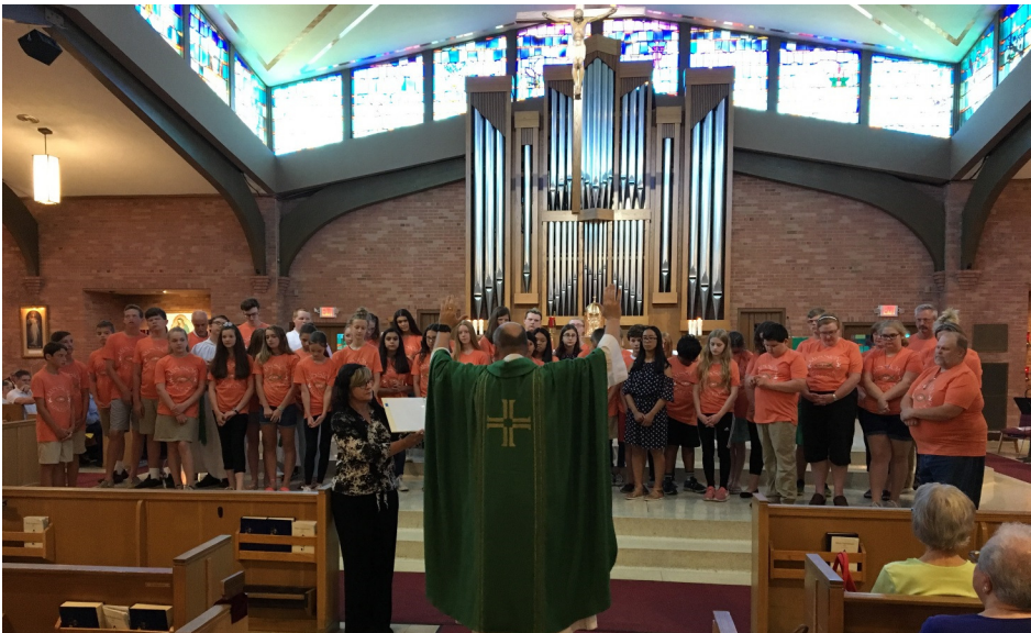
Blessing for Mission Makeover