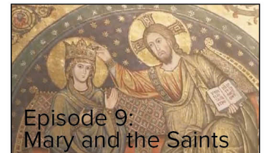
Episode 9: Mary and the Saints

What is our connection to Mary and the rest of the saints? Why do we ask Our Lady and other "dead people" to pray for us? Discover a framework for the Communion of Saints.