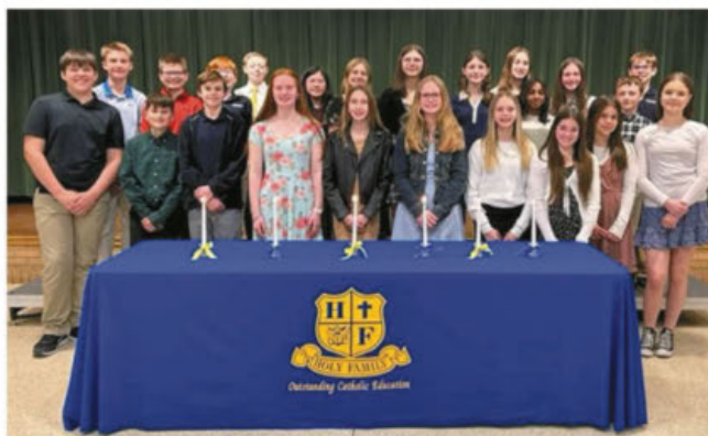
6 th Grade NEW NJHS Members