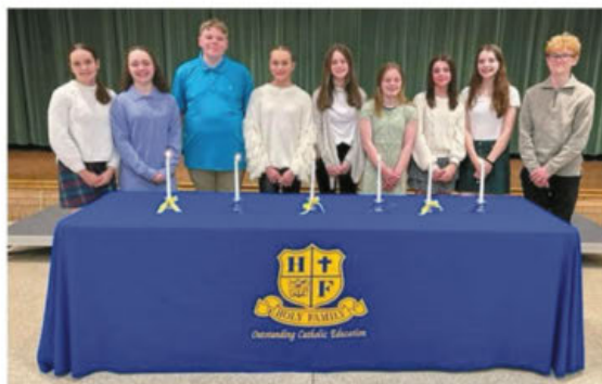
8 th Grade NJHS Members