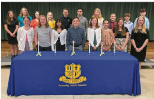
7 th Grade NJHS Members