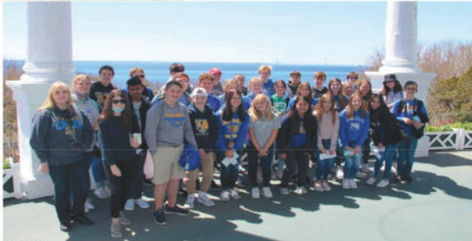
*masks were removed for photos.