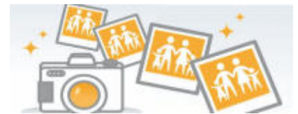
Photo submissions are due to the parish office by September 1. Pictures must be wallet size or larger and preferably recent

with a solid background. Please call the parish office for more information or to update your contact information.