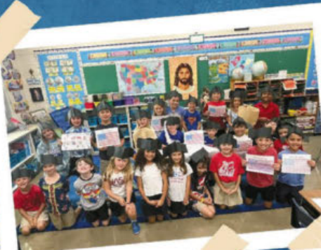
2nd Grade celebrating Constitution Day