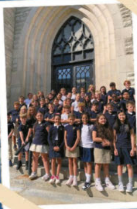
5th Grade in Lansing