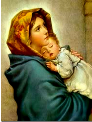
Madonna of the Streets