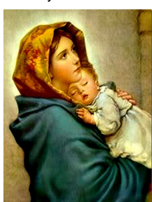
Madonna of the Streets

"Thus says the Lord: Share your bread with the hungry, shelter the oppressed and the homeless; clothe the naked when you see them, do not turn your back on your own."